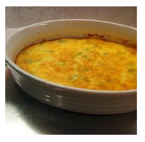
This CHRISTMAS EGG PUFF was a

(NOTE: actually very good dip even without the topping--K.)