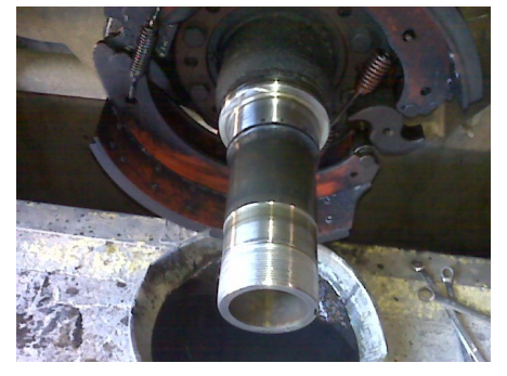
most of all. Now what? you ask yourself, we all do or have done that.

In a walk around the Coach, taking in the sights of what winter has left, one might notice around the lug nuts or hubs, black spider web runs of greasy oils. And on closer inspection there is a slight oily film on the inside of the tires, the drive axle