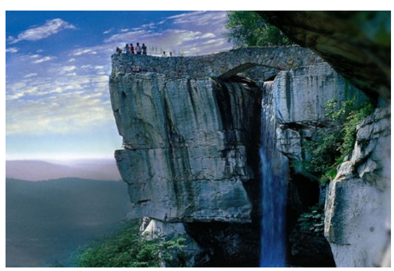
2<sup>nd</sup> Annual Blue Bird Chapter Family Reunion

Chattanooga, TN sits right in the cross hairs of I-75, I-24 and I-59. It is bordered by the Great Smoky Mountains, the Tennessee River and the beautiful North Georgia Mountains. Its beginnings are steeped in the traditions of the old south and cemented in place by the Civil War. Come join us for our 2<sup>nd</sup> Annual Blue Bird Family Reunion to be held at the Camp Jordan RV Park in East Ridge (Chattanooga), TN October 25<sup>th</sup> - October 30<sup>th</sup>, 2011.