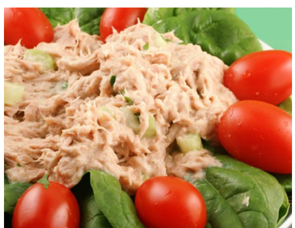
(New Way) Tuna Salad

On those still hot days in September, a different way to do tuna might be just the right lunch or simple supper.